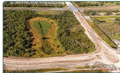
Construction at the eastern end of the bridge over I-75, and the new 44th Avenue East roundabout and connection to south Lena Road

Construction activities are active Monday through Friday, between the hours of 7 a.m. and 6 p.m. , with Saturday and nighttime work to be conducted on an as-needed basis. Travelers are asked to be mindful of construction equipment and materials being operated and staged in right-of-way areas.